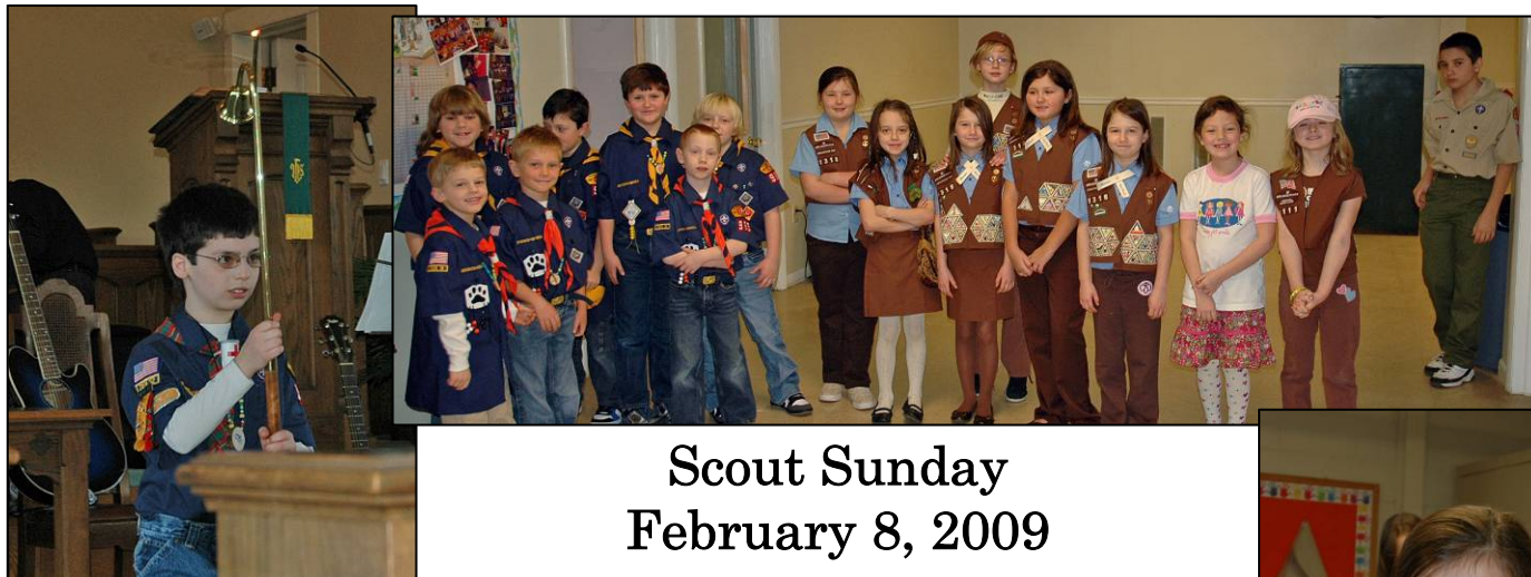
Scout Sunday February 8, 2009